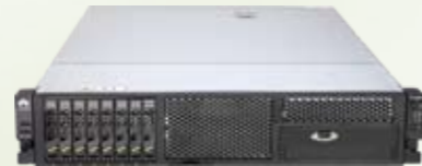
RH2288 V2 (8 hard disks)

The HUAWEI Tecal RH2288 V2 (RH2288 V2) is a new-generation 2U 2-socket rack server. Featuring two Intel® Xeon® E5-2600 series processors, the RH2288 V2 provides a memory capacity of 768 GB and a storage capacity of 38 TB, making it an ideal product for critical services and cloud computing.