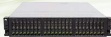
RH2288 V2 (26 hard disks)