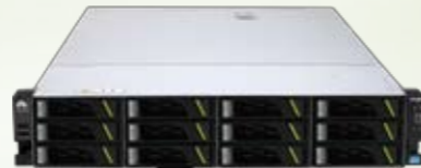
RH2288 V2 (14 hard disks)