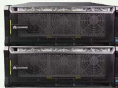
RH5885 V2 (8 sockets)

The Huawei Tecal RH5885 V2 is a high performance 4-socket or 8-socket rack server. It supports Intel® Xeon® E7-8800/4800 series processors and can accommodate up to 80 cores with 4 TB memory. It offers enhanced system reliability thanks to its 35 RAS features. The RH5885 V2 is an ideal choice for deploying mission-critical applications such as large-scale databases, business intelligence analysis and ERP.