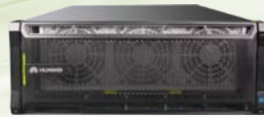
RH5885 V2 (4 sockets)

The RH5885 V2 adopts a modular design, simplifying maintenance and reducing downtime due to upgrades and component replacement. Most of the components can be maintained without opening the chassis cover. The swap time of each component is less than 1 minute. The swappable modules include: